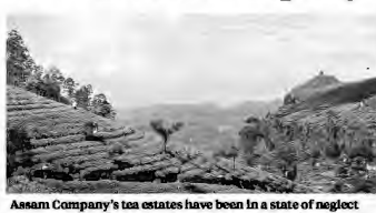
Assam Company's tea estates have been in a state of neglect owing to years of stress on the firm's revenues and margins